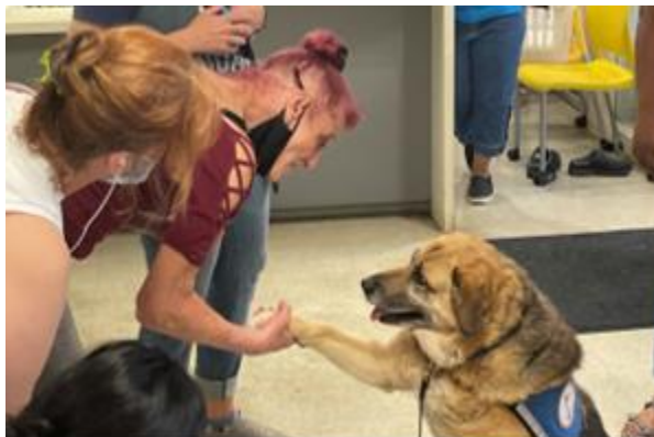
Pet therapy for vulnerable women at Sarah's Circle.

While Sarah's Circle continues to help change the lives of numerous women, there are still far too many people experiencing the trauma of homelessness. Before coming to Sarah's Circle, many clients had been living in a place not meant for human habitation like an abandoned building or a temporary situation like a medical facility or other emergency shelter. Furthermore, of the women Sarah's Circle serves, more than one in three have reported experiencing domestic violence.