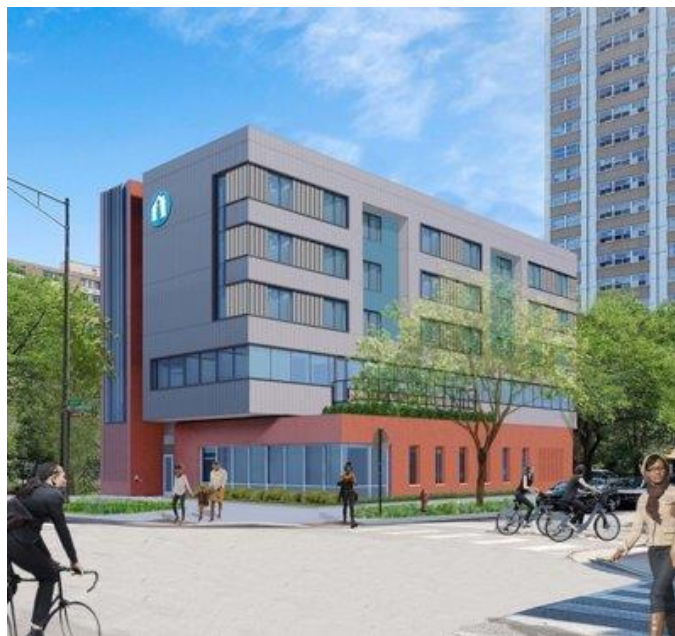
Sarah's on Lakeside, on track to open in 2024 in Uptown Chicago. The facility will provide 28 affordable housing units, more communal space, a demonstration kitchen, and case management offices.

According to Housing Action Illinois there are only 36 affordable rental units for every 100 extremely low-income renter households in Illinois. Sarah's Circle is working to permanently end homelessness for women in Chicago by building permanent housing for Chicago's most vulnerable women and providing continuous case management and support.